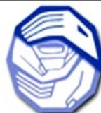
The hand of Christ blesses the cup