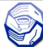
The hand of suffering receives the cup