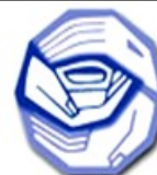
The hand of love offers the cup