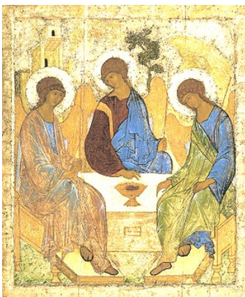
Rublev, depicted three angelic beings sharing a meal in perfect communion of love.