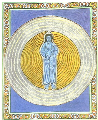
Hildegard of Bingen illustrated the trinity through a circle of fire surrounded by water with Christ in the middle.