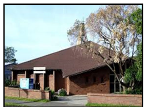
Christ the King, Mayfield West