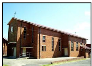
St Peter-in-Chains', Stockton