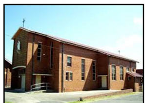
St Peter-in-Chains', Stockton