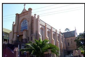
St Mary, Star of the Sea, Newcastle