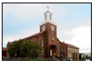
Immaculate Heart of Mary, Tighes Hill