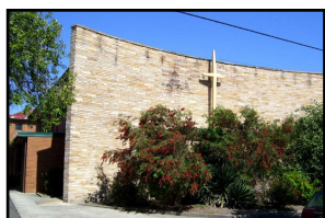
St Joseph's, The Junction