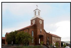
Immaculate Heart of Mary, Tighes Hill