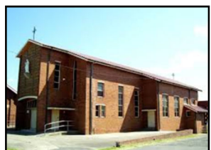
St Peter-in-Chains', Stockton