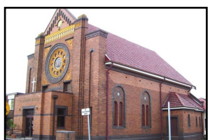
St Laurence O'Toole's, Broadmeadow