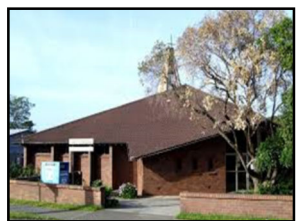
Christ the King, Mayfield West